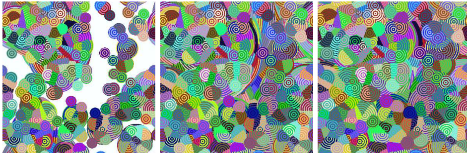
Figure 1: Stable allocations with appetites \alpha = 0.8, 1, 1.2 . The centers are chosen uniformly at random in a 2-torus, with one center per unit area. Each territory is represented by concentric annuli in two colors.